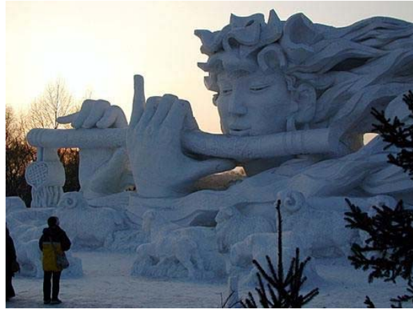
The temperature in Harbin reaches forty below zero, both Fahrenheit and centigrade, and stays below freezing nearly half the year. The city is actually further north than notoriously cold Vladivostok, Russia, just 300 miles away. So what does one do here every winter? Hold an outdoor festival, of course! Rather than suffer the cold, the residents of Harbin celebrate it, with an annual festival of snow and ice sculptures and competitions .

VOL. 13 No. 2, FEBRUARY, 2008 NEWS FOR DELAWARE COUNTY MASTER GARDENERS